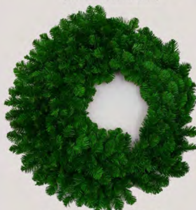
Left half fluffed