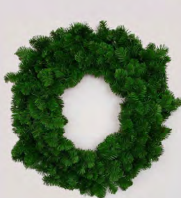
Out of the box