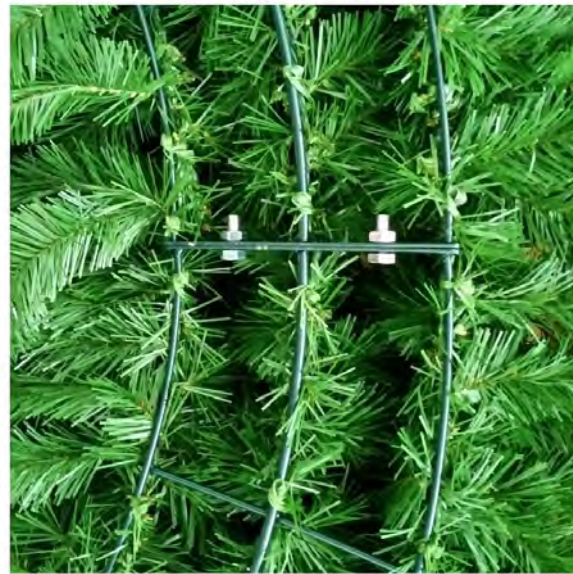
Commercial Grade Frame and PVC Noble Fir