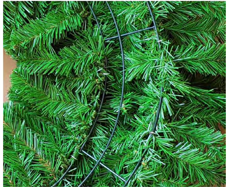
Commercial Grade Frame and PVC Noble Fir